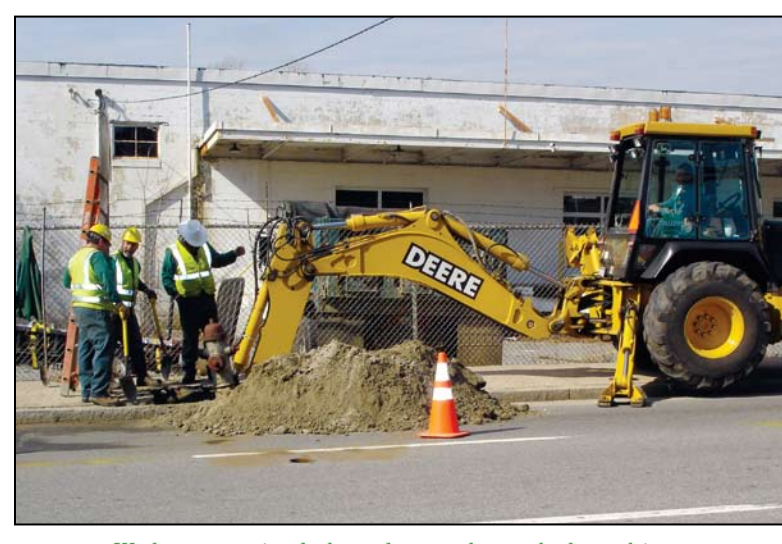
Work crews repair a hydrant that was damaged when a driver lost control of his/her vehicle

Occasionally, rate adjustments are necessary to address essential system improvements. Your consideration is greatly appreciated when this is required. Be assured this is only done when necessary and each program is fully reviewed and approved by the Public Utilities Commission.