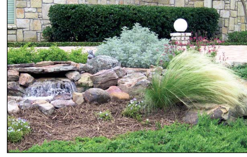
Drought resistant landscaping

In 2005, the Kent County Water Authority Board of Directors contacted the Rhode Island Water Resources Board and each State Senator and Representative to rally support to build the Big River Reservoir. We continue to believe that the Big River Reservoir project is vital to the future of our state water resources for both economic and domestic concerns. The majority of Rhode Island businesses and homes rely on one reservoir system for their water supply. It has been suggested that the Scituate Reservoir may be on the verge of reaching its maximum daily production capacity. What