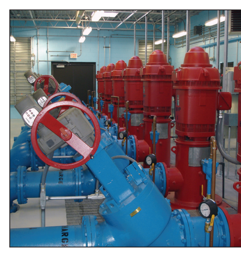
New technology, Clinton Avenue Pump Station.

These meters can be read remotely without the need to be at the customer's premisis. This type of meter also provides builtin leak detection and consumption trending which can help provide the information necessary to answer customer questions on an unusual or abnormal consumption or billing concerns. Our goal is to eventually replace all existing meters with this type of technology, as our programs advance and the new equipment becomes more readily available for installation.