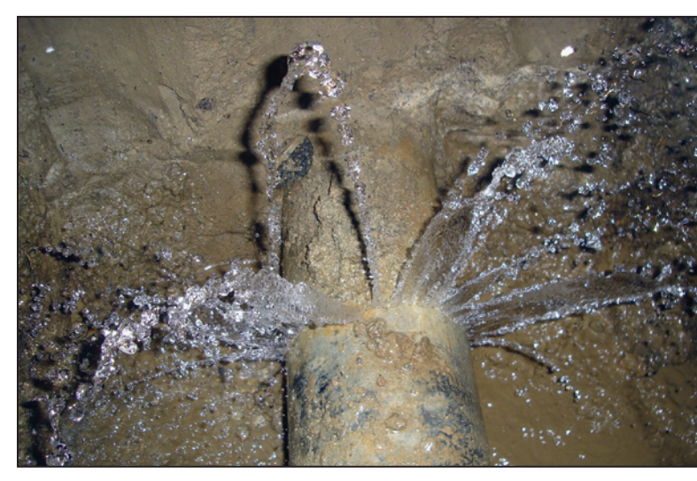
Radial stress crack in aged infrastructure

It is imperative for the continued viability of your water system to replace aging water mains, rehabilitate tanks and pumping stations, and implement programs that streamline our service to our customers. Several projects are currently underway to replace failing water mains, enhance hydrant fire flow and better service our customers. Costs associated with these improvements are incorporated in the rate structure for your billing. Occasionally, rate adjustments are necessary to address essential system improvements. Your consideration is greatly appreciated when this is required. Be assured this is only done when necessary and each program is fully reviewed and approved by the Public Utilities Commission.