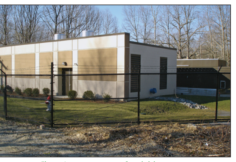
Clinton Avenue pump station after rehabilitation project

The new 500 gradient Read Schoolhouse Road Tank project is one step closer to the construction phase. After much negotiation, the town of Coventry has approved a land swap necessary to more economically build the new tank on a town site abutting the existing KCWA site. Once activated, the new tank and transmission mains will improve overall service to this area of Coventry. This year we also moved forward with a system wide hydraulic study to evaluate the transmission, distribution, storage and hydraulic capability of the existing system. This is the first step in development of a revised Capitol Improvement Plan. We expect to move forward with the full revised Capital Plan development study during the upcoming year.