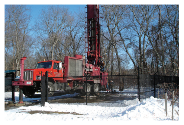
Redevelopment of East Greenwich well

rehabilitation project design incorporates design considerations and appurtenances, as necessary, to make the facilities constructed under the rehabilitation project compatible with the envisioned capital improvement treatment facility plans.