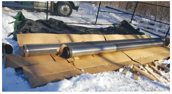
Replacement well screen

Monitoring Your Meter: Each meter register is equipped with a leak detection feature. On older registers it's a small triangular indicator. On the newer digital registers it's a blinking faucet that must be activated by waving a flashlight over the register. The process is simple. Make sure no one is using any plumbing fixture or appliance in the home. During this period observe the register indicator. If the triangle is rotating or faucet is flashing, in the case of a digital register, this indicates a leak. You can further investigate the source of the leak by isolating or shutting the water valve off to each toilet and appliance one at a time. Check the leak detector each time after isolating each plumbing fixture. If the detector stops you have found the source and a plumber should be able to assist you with the repair. If you have a question about this leak detection process feel free to call one of our customer service representative and they will be happy to assist in this concern.