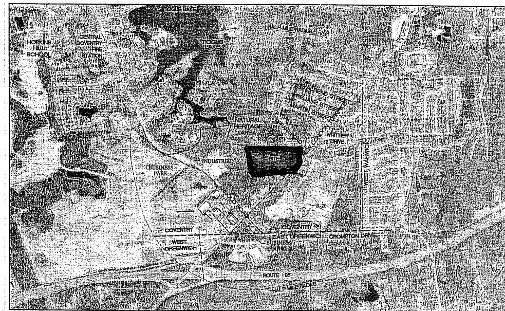
AERIAL IMAGE 1" = 1,000'

A.P. 16, LOT 3 NEW LONDON TURNPIKE COVENTRY, RHODE ISLAND