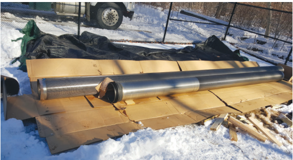
Replacement well screen

Monitoring Your Meter: Each meter register is equipped with a leak detection feature. On older registers it's a small triangular indicator. On the newer digital registers it's a blinking faucet that must be activated by waving a flashlight over the register. The process is simple. Make sure no one is using any plumbing fixture or appliance in the home. During this period observe the register indicator. If the triangle is rotating or faucet is flashing, in the case of a digital register, this indicates a leak. You can further investigate the source of the leak by isolating or shutting the water valve off to each toilet and appliance one at a time. Check the leak detector each time after isolating each plumbing fixture. If the detector stops you have found the source and a plumber should be able to assist you with the repair. If you have a question about this leak detection process feel free to call one of our customer service representative and they will be happy to assist in this concern.